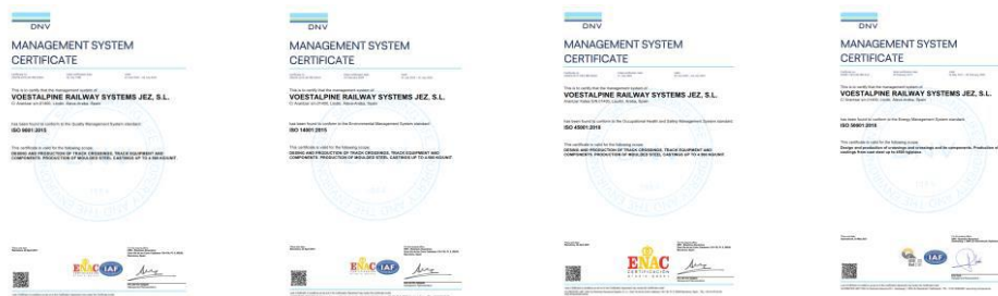
Figure1.ISO 9001, ISO 14001, ISO 45001, ISO 50001 Certifications.

The development of projects for improvement of Environmental Management (ISO 14001), Energy management (ISO 50001) and Total Quality (ISO 9001) guarantee product excellence, as well as respect for the environment. JEZ is committed to occupational risk prevention and holds the Health and Safety Management Systems certificate (ISO 45001).