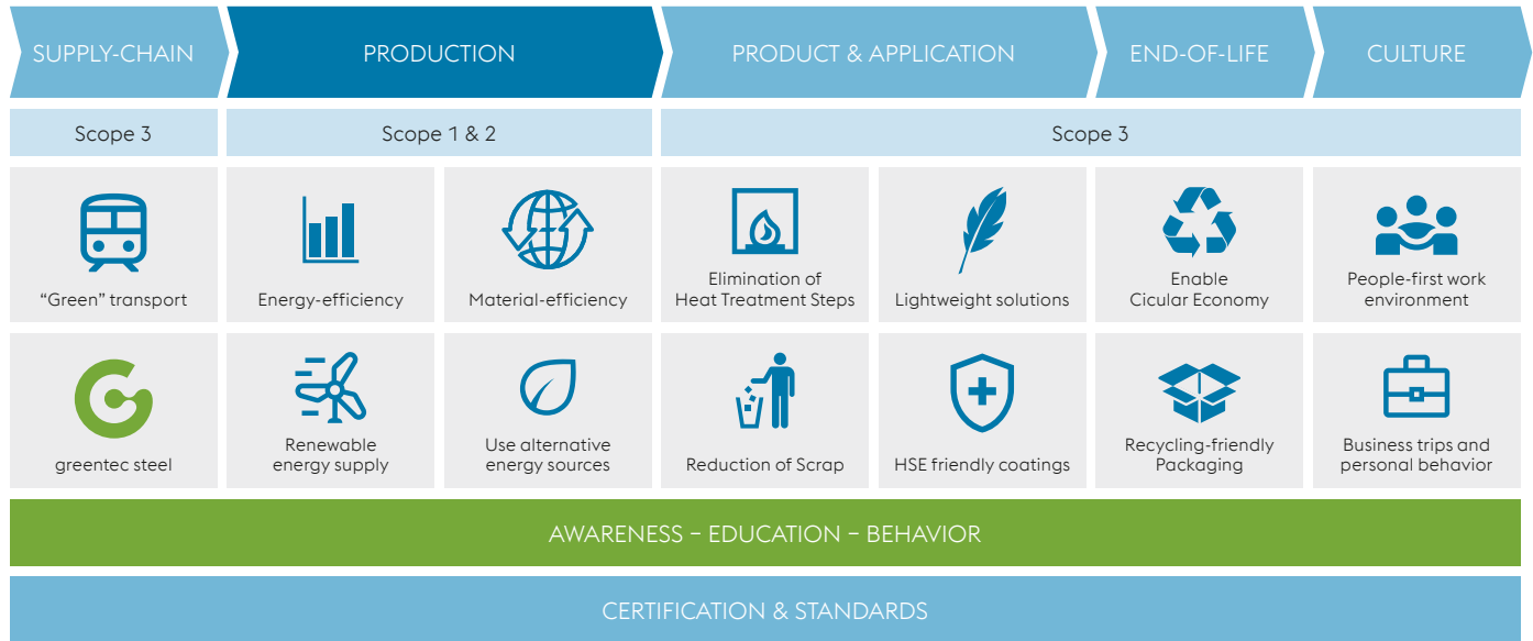
Illustration 2: Climate strategy voestalpine Wire Technology

An ambitious goal requires ambitious planning. To achieve the goal of CO 2 neutrality, we have developed a Roadmap 2 Zero.