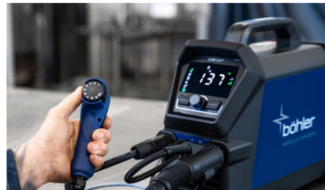
Wired remote control