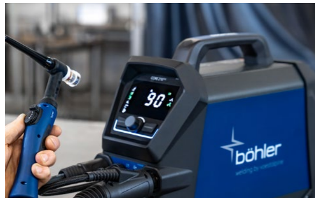
Potentiometer TIG torch