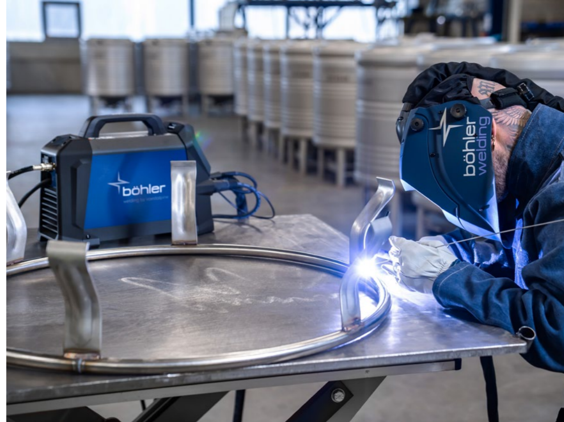
Precise ignition and superior arc performance.

ENGINEERED FOR CLARITY – EXPANSIVE HIGH CONTRAST DISPLAY