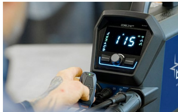
Wireless remote control

Adjust your welding current effortlessly with a range of wired or wireless control options, available as optional field kits. Enjoy maximum flexibility right at your fingertips.