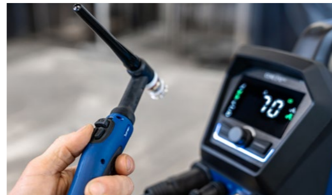
Up/down TIG torch