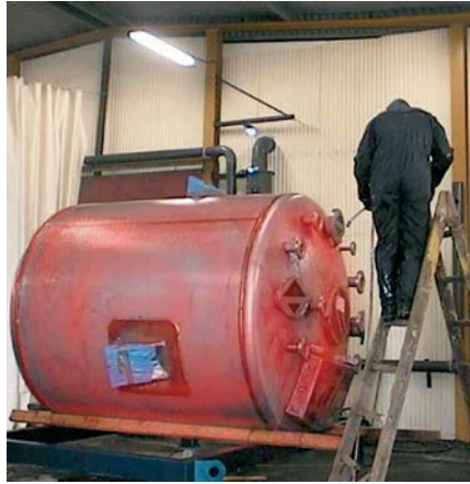
RedOne™ Pickling Spray 240