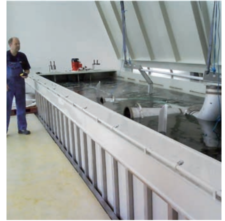
Pickling Bath 302