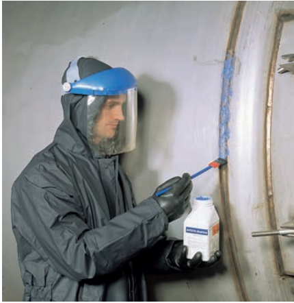
BlueOne™ Pickling Paste 130